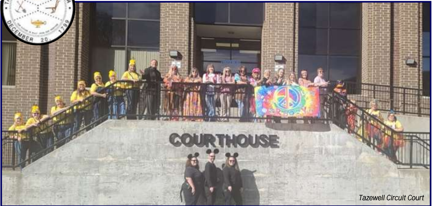
Tazewell Circuit Court