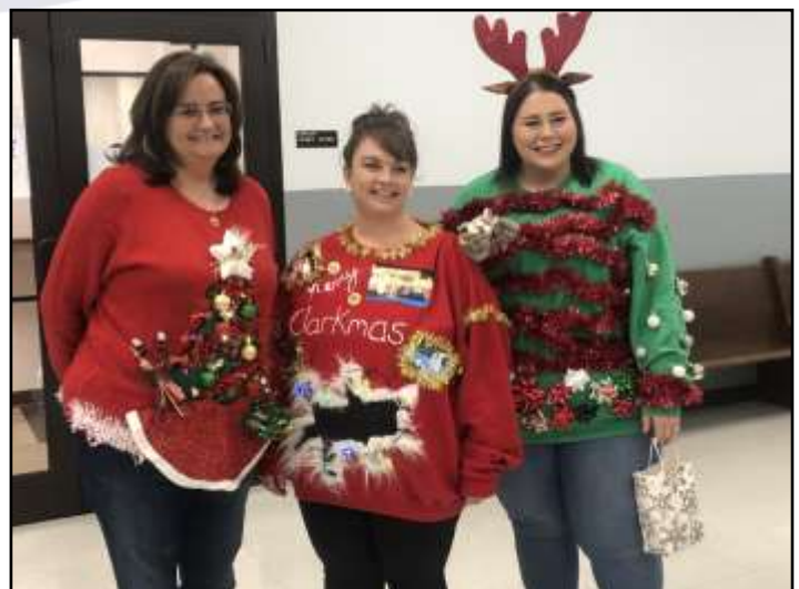
The Tazewell County Courthouse participated in an Ugly Christmas Sweater Contest. We have some pretty creative employees!