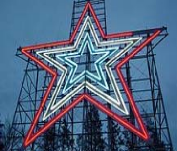
The Roanoke Star was constructed in 1949, and is placed at the top of Mill Mountain in Roanoke, VA.

The Judicial Learning Center exhibits provide an overview of Virginia's judicial system, the rich history of Virginia's judiciary, and its contributions to the development of America's legal system.