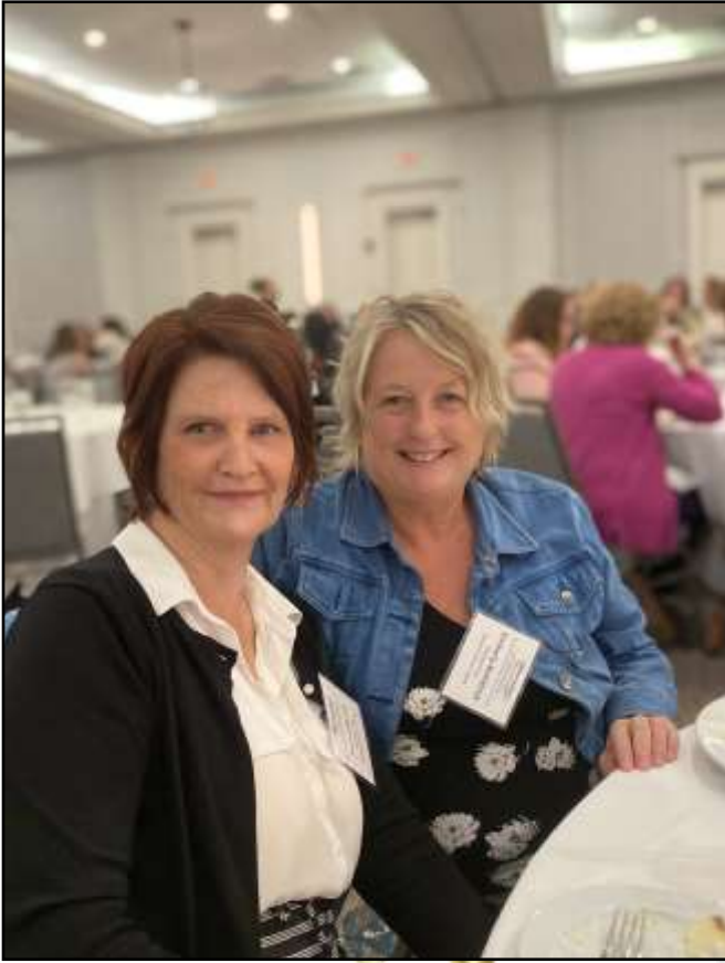
It's been great catching up!