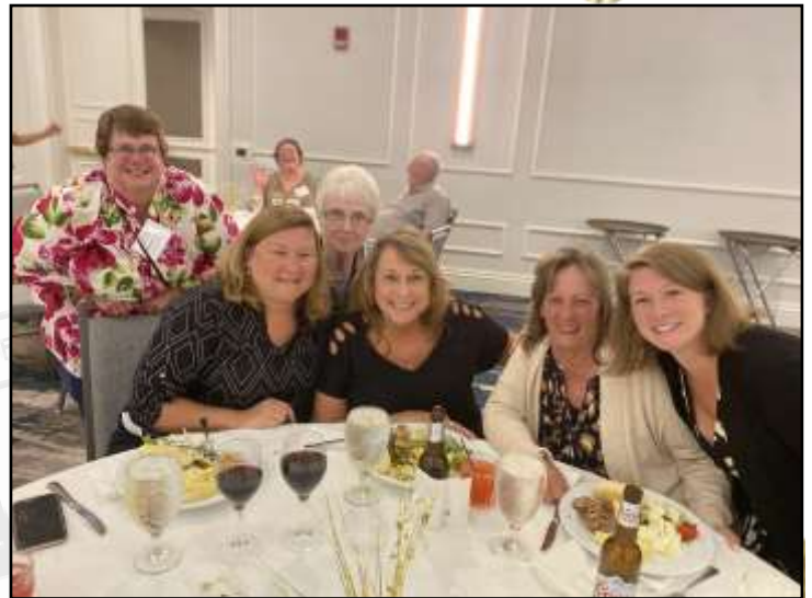
How have you been?