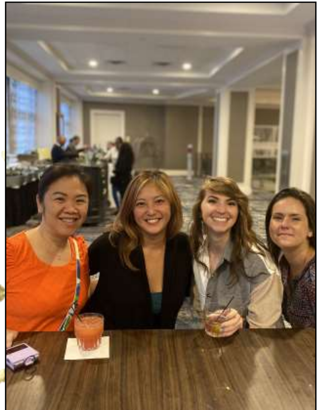
Pleasure meeting you!