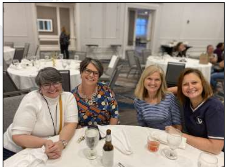
Has it really been three years?