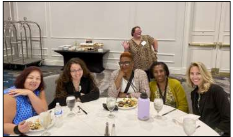
It's been too long!!