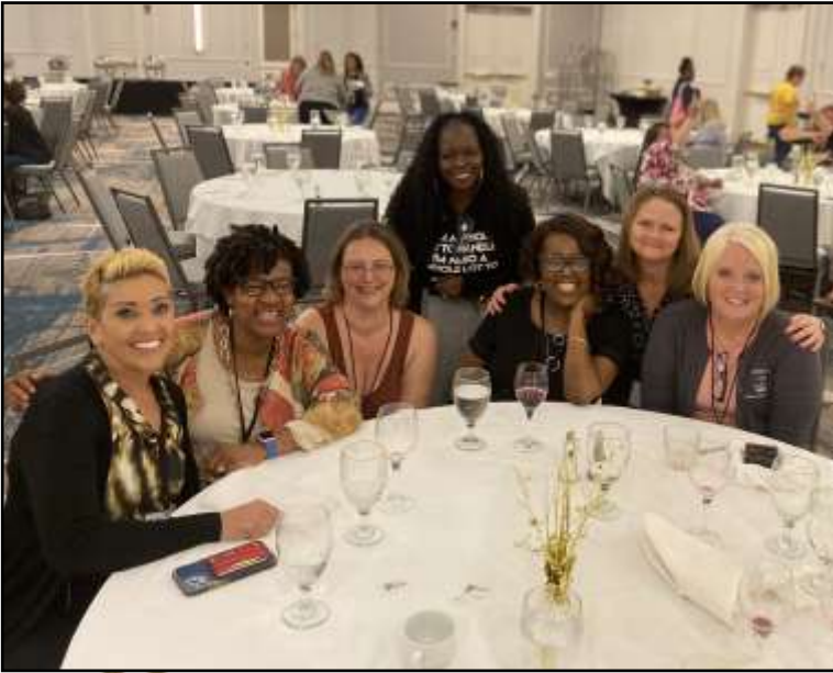
So nice to get out of the office!!