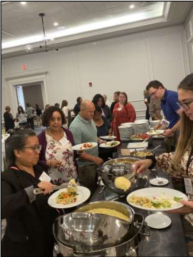
The hot buffet dinner was delicious.