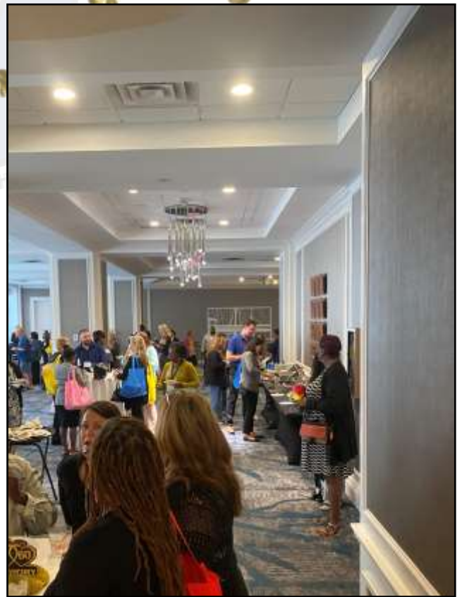
Drinks and Hors d'oeuvres, served for cocktail hour before dinner.